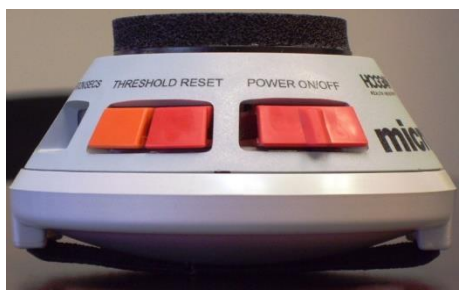
Figure 2. Device Buttons