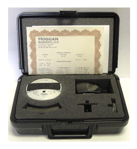
Figure 1: The microFET®2 device in supplied carry case